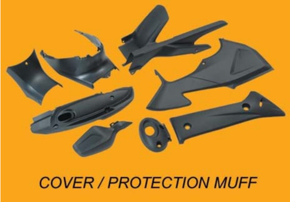
COVER / PROTECTION MUFF